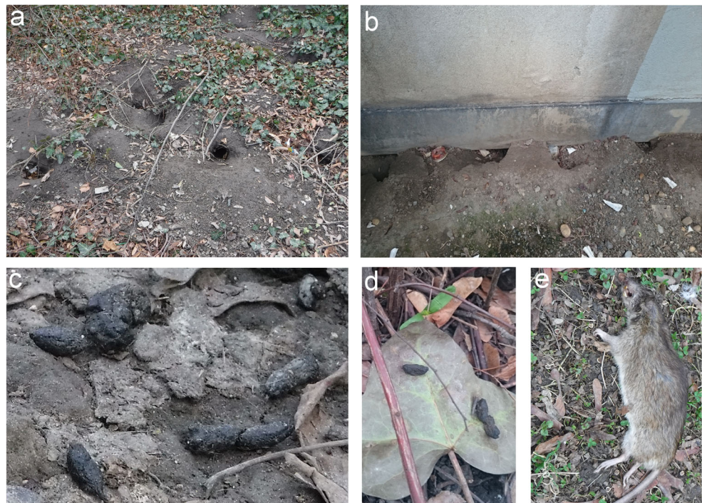
Fig. 2 Examples of rat signs that can be observed in urban habitats. a, b. Burrow entrances. c, d. Rat faeces. e. Dead rat, possibly resulting from anticoagulant poisoning

will considerably reduce the chance of failure during fieldwork.